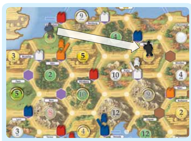
Example: Red rolls a "7" and decides to move the robber from her "8" pasture hex, to the "10" saltworks hex. Red can steal a resource card from either White or Blue, she chooses Blue.