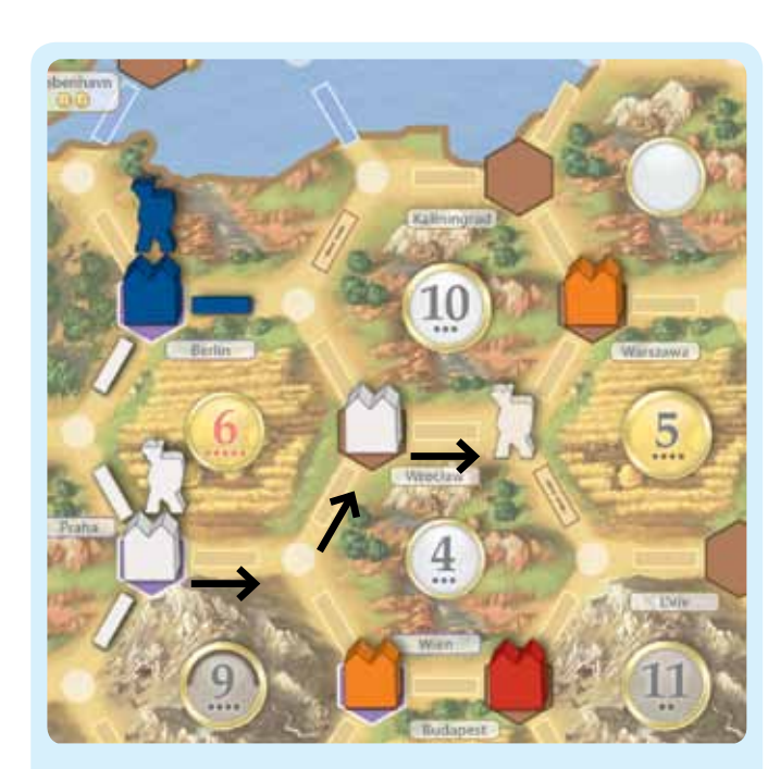
Example: It is White's turn. She recruited a merchant and placed it next to Praha. To improve her salt production, White wants to move the merchant to Kaliningrad. Unfortunately, she only has 1 grain. White moves her merchant a distance of 3 intersections, onto the intersection east of Wroclaw. On her next turn—provided that she has acquired 1 grain—White could then move her merchant to Kaliningrad and build a trading post there.