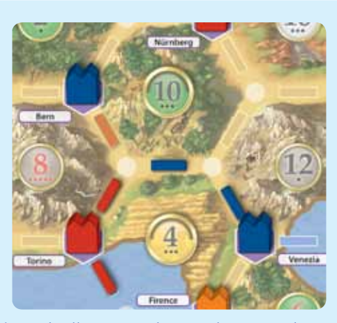
Example: In the illustration above, Red opens up the trade route north-east of Torino. He thus connects the city-site Torino with another city-site—Venezia—for the first time. The connection is 3 trade routes long. Red receives 1 gold for her trade route and Blue receives 2 gold for his 2 trade routes. Red now uses another trade route to connect the upper blue city (Bern) with other cities for the first time. The shortest route between these city-sites is 2 trade routes long, for which she receives 2 gold. The longer route, Venezia to Bern (3 trade routes), gets nothing.

Double arrow on paths: If you convert a path marked with a double arrow into a trade route, you may immediately place another trade route at no cost. This trade route must be adjacent to the trade route you have just opened up.