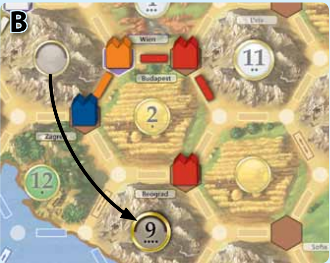
Example: A Red has recruited a merchant in Budapest. She sends it to Beograd and builds a trading post there. Beograd borders on two terrain hexes that have no number yet. The two face-down number tokens for mountains were already placed on other terrain hexes; a face-down number token for grain is still available.

B Red chooses the mountains. She moves the number "9" token onto the new mountains hex, thus reducing her opponents' ore income—and improving her own ore income, of course.