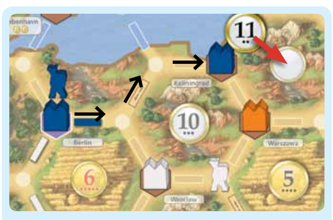
Example: It is Blue's turn, and he decides to foil White's plan. Blue pays 2 gold to buy 1 grain, then moves his merchant to Kaliningrad and builds a trading post there. Blue returns his merchant to the supply. Because he has built the trading post, he now must place a number token on the empty token space. There is only 1 white face-down number token left in the supply, so Blue turns the token face up—it is an 11. Blue places it on the blank saltworks circle in the center of the hex.

Place and move a number token: If a newly built trading post is adjacent to a terrain hex without number in the center of the hex, choose one of the face-down number tokens from the supply and place it on the token space of that terrain hex. The number token must have the same color as the hex's token space. If there are no more face-down number tokens of matching color in the supply, you must move a number token has already been placed. Remove any number token of matching color from another terrain hex and place it on the empty token space of your new terrain hex.