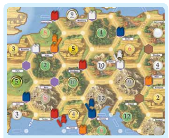
Example: A "5" was rolled. Blue has a trading post in Lyon adjacent to the pasture bex. He receives 1 wool. Orange and Red each have 1 trading post (in Köln and Nürnberg) adjacent to the fields bex whose number was rolled; they receive 1 grain each. White does not receive any resources from the roll, so White takes 1 gold from the supply as compensation.

If you do not receive any resources after a production roll, take 1 gold as your compensation. This occurs when all of your trading posts fail to produce: whether due to not having a trading post adjacent to the number rolled, due to being occupied by the robber, and/or due to a shortage of resources. This rule applies to all players, not just the player rolling the die. However, no gold compensation occurs if a 7 is rolled.