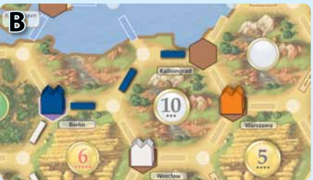
Example: In the illustration above, Blue wants to connect to Kaliningrad. He places his first trade route on a path marked with a double arrow and may immediately place a trade route on the second path towards Kaliningrad, at no cost. As a reward for connecting Kaliningrad for the first time, Blue receives 3 gold.