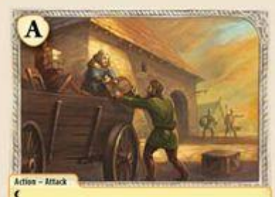
Tactical Retreat If you remove one of the buildings you placed in your opponent's principality, you receive any 2 resources of your choice, 1 of which your opponent must give you.