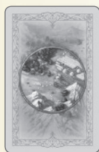
Card Back Resource Cards