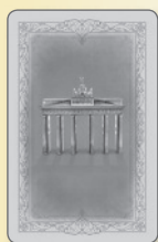
Card Back Development Cards