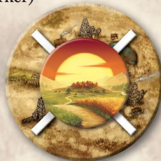
Champion of the Environment token