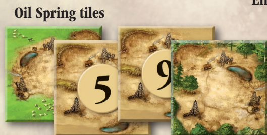
Oil Spring tiles